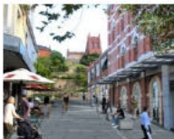
Newcastle Urban Renewal Strategy