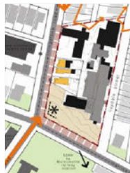
Marrickville Civic Site

Positions: Associate, senior urban designer