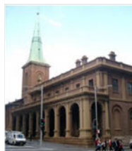
King St Courts