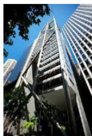
9 Castlereagh St

Positions: Project architect, graduate architect, student architect